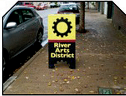
Museums and artist workspaces.