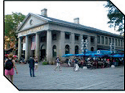
Conservation of built heritage. Re-use derelict buildings.