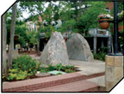
Public art installations.